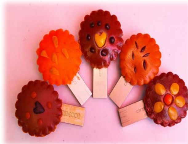
Figure 7: The Shape of Molded Clay on Top of Flash Drive after Kanom Farang Kudeejeen

The shape of Kanom Farang Kudeejeen was selected by the community as a souvenir. The data obtained from the interview confirmed that the community would like to make a souvenir from Thai clay which is easily found in the area. Molding clay is an easy production method for community people to do and adapt to different shapes and types of molded things. The souvenir is a Thai clay mold in the shape of Kanom Farang Kudeejeen and the molded clay is on the top of a flash drive. The story of Kudeejeen Community and Luk Kudeejeen Song are recorded on the flash drive. The developed souvenir is shown in Figure 7.