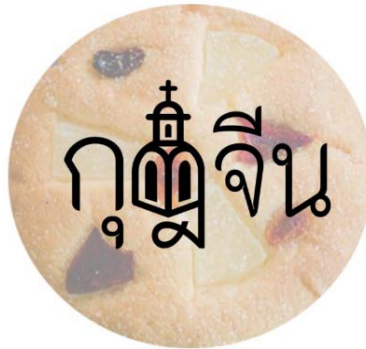
Figure 8: Logo of Kudeejeen Community Showing Kanom Farang Kudeejeen and Santa Cruz Church (Designed by Singh Singkhajorn, 2019)

Singkhajorn et al (2020) reported planning marketing communication of Kudeejeen Community in the following procedure: (1) analysis of problems and opportunities as part of SWOT analysis, (2) identification of the objectives, which involve creating images, attitudes, perception, and purposes (Angkura 2019) in order to bring Kudeejeen tourism to life with souvenirs and a composed song in orchestra, (3) market segmentation toward local and foreign tourists, aged between 15-55 years old who access tourist information online, and 4) content creation to be precise and concise. Message brevity in marketing communication channels is accompanied by beautiful photos and creative storytelling (Singkhajorn 2018a, 2018b). The video on Kudeejeen Community Tourism is shown in Figure 9.