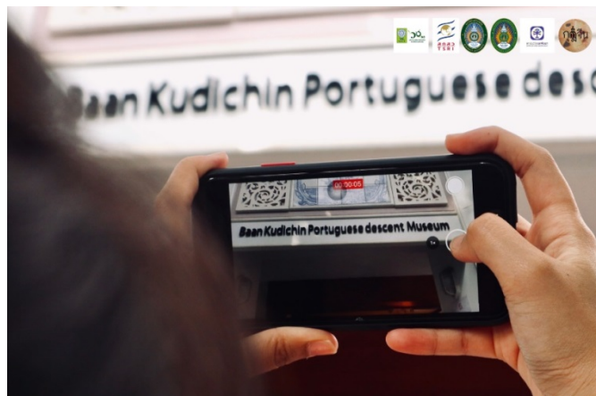
Figure 9: Video Promoting Kudeejeen Community Tourism

Singkhajorn et al (2020) reported planning marketing communication of Kudeejeen Community in the following procedure: (1) analysis of problems and opportunities as part of SWOT analysis, (2) identification of the objectives, which involve creating images, attitudes, perception, and purposes (Angkura 2019) in order to bring Kudeejeen tourism to life with souvenirs and a composed song in orchestra, (3) market segmentation toward local and foreign tourists, aged between 15-55 years old who access tourist information online, and 4) content creation to be precise and concise. Message brevity in marketing communication channels is accompanied by beautiful photos and creative storytelling (Singkhajorn 2018a, 2018b). The video on Kudeejeen Community Tourism is shown in Figure 9.