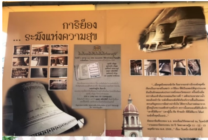
Figure 5: The History Book of Carillon Bell

The characteristics of 16 bells give power to the community’s song. The musician uses a thumb finger to hit the keyboard, which links to a sling to hit each bell. At present, there are only two male players in the community who can perform on the Carillon Bell. With participation from the community’s leaders, the research team rearranged a new version for Luk Kudeejeen to sing in accompaniment of the bells.