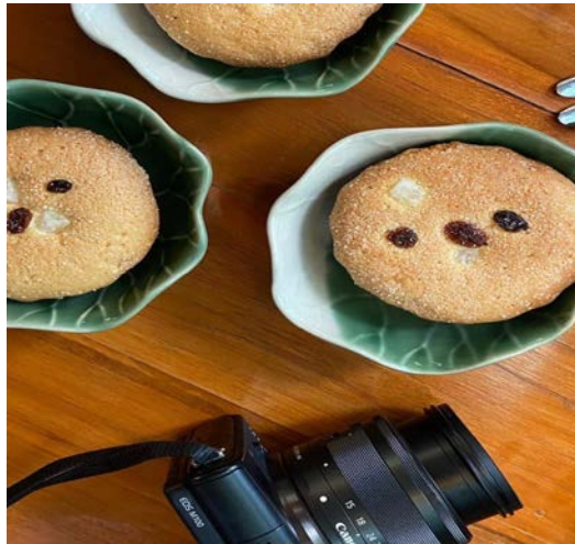
Figure 6: Kanom Farang Kudeejeen, 2023

The shape of Kanom Farang Kudeejeen was selected by the community as a souvenir. The data obtained from the interview confirmed that the community would like to make a souvenir from Thai clay which is easily found in the area. Molding clay is an easy production method for community people to do and adapt to different shapes and types of molded things. The souvenir is a Thai clay mold in the shape of Kanom Farang Kudeejeen and the molded clay is on the top of a flash drive. The story of Kudeejeen Community and Luk Kudeejeen Song are recorded on the flash drive. The developed souvenir is shown in Figure 7.