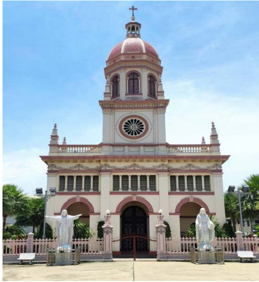
Figure 4: The Carillon Bell at Santa Cruz Church, Kudeejeen Community, 2024